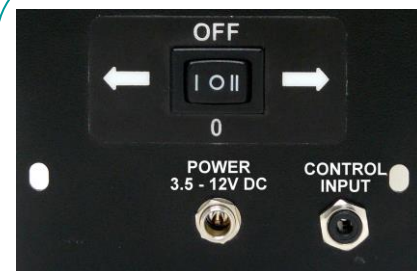
External Control Option Rear Panel